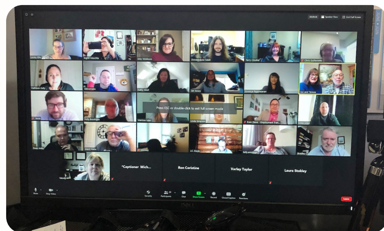
Training participant Sault College

I truly believe that this type of training should be implemented on a regular/ongoing basis. The format in which this training was provided was easy to follow, well organized and the facilitator was very engaging.